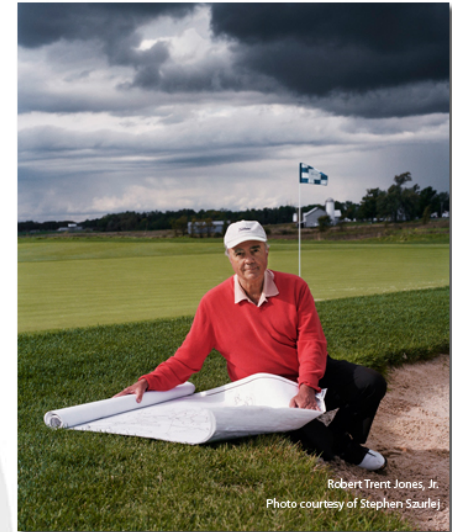
Robert Trent Jones Junior