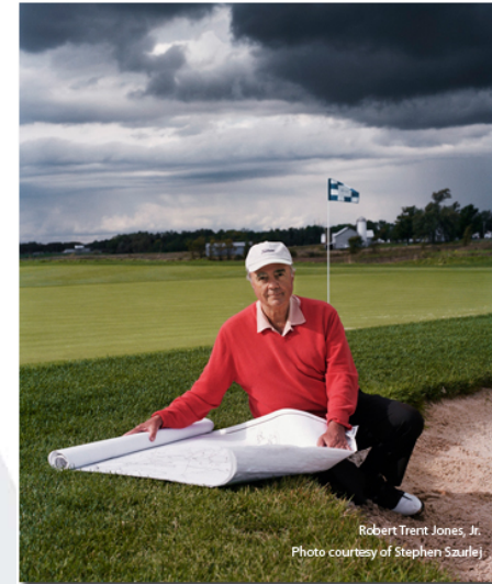
Robert Trent Jones, Jr.

Bro Hof's surroundings are unbelievably beautiful and, for the first time in twenty years, a course has been built right by the water. Robert Trent Jones, who has been synonymous with the ultimate in golf design for over 30 years, has finally designed a course in Sweden. It is probable that no other course in the world has had such specified requirements.