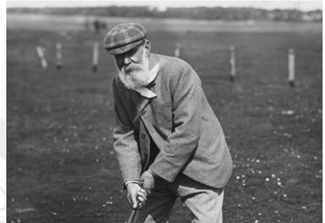
Old Tom Morris

The Machrihanish Golf Club is a classic Scottish links course situated in Machrihanish at the southern tip of the Mull of Kintyre. The main course, with views of the western seaboard including the Paps of Jura and Ireland, was ranked the #39 course outside of the United States by Golf Digest in 2005. In particular, the first hole is often rated as one of the best opening holes in the world. The golf club was founded in 1876 as the Kintyre Golf Club. The course had ten holes before the club officially existed, and was quickly expanded to 12. In 1879, Old Tom Morris was brought in to redesign and expand the course to the full 18 holes, including today's first hole. J.H. Taylor made some modifications in 1914, and in the 1940s Sir Guy Campbell brought the course to its current configuration.